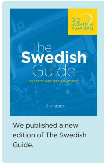
We published a new edition of The Swedish Guide.